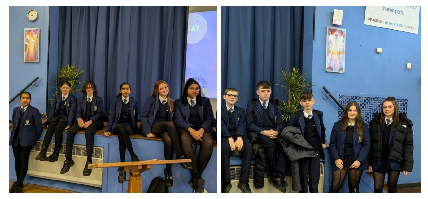
Well done to last week's winners 9W who had the most ASAPs last week!

Fantastic effort from 9R who have the highest overall points this week!